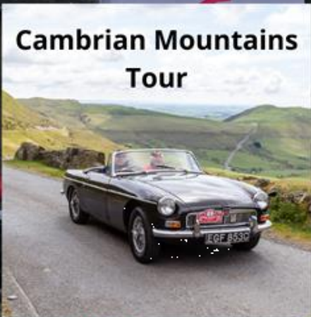
Cambrian Mountains Tour