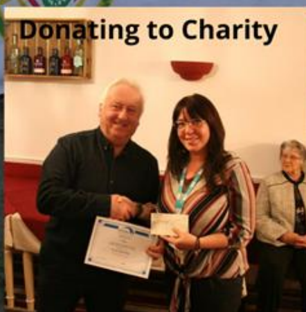
Donating to Charity